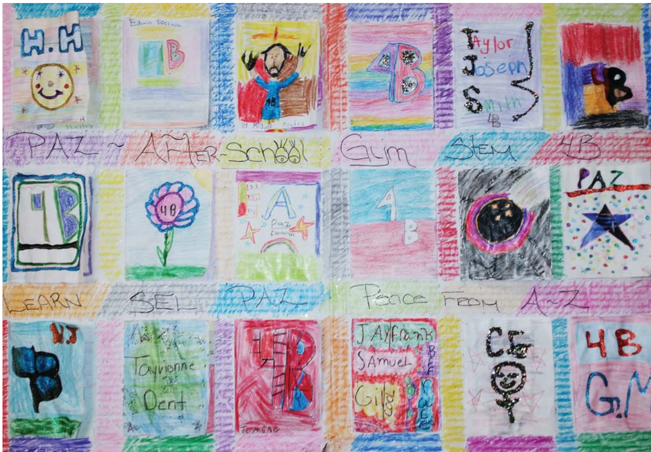
Kids of PAZ 4B!

Below: A beautiful thank you card we got from 4th-graders at PAZ@214. Right: Two PAZ girls interview each other.