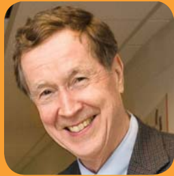
A message from the Executive Director

Instead of trying to control behavior through rewards and punishments, we help students internalize values and ways of thinking that lead to responsible behavior.