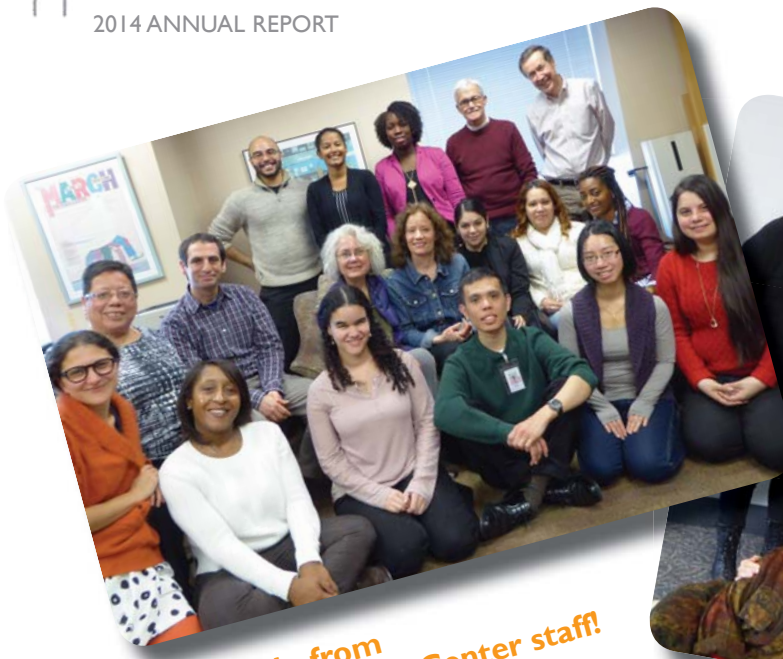
Hello from Morningside Center staff!